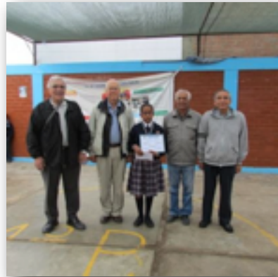
Rotary Sherwook Park Scholarship