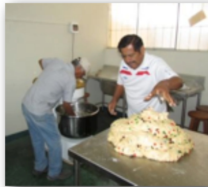
PaneTonys (Peruvian Christmas Bread)