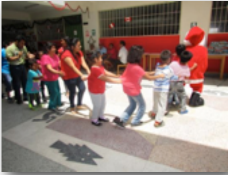
Christmas Party For Special People