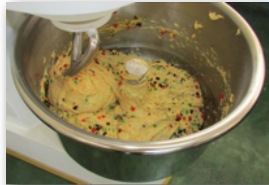
PaneTonys (Peruvian Christmas Bread)