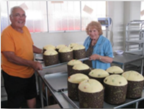
PaneTonys (Peruvian Christmas Bread)