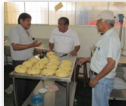
PaneTonys (Peruvian Christmas Bread)